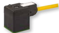
MSUD valve plug connector