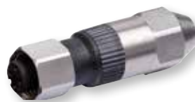
V2A M12 Mosa with IDC technology