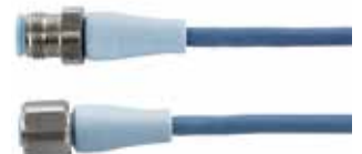
M12 F&B PP Line in Hygienic Design