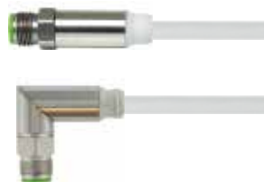
V4A connector M12, straight and 90°