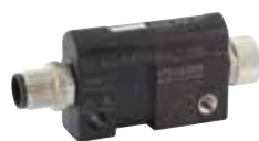
IO-Link Analog Adapter