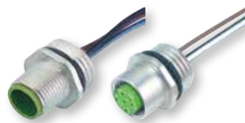
M12 Flange Connectors