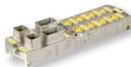
MVK Metal Safety